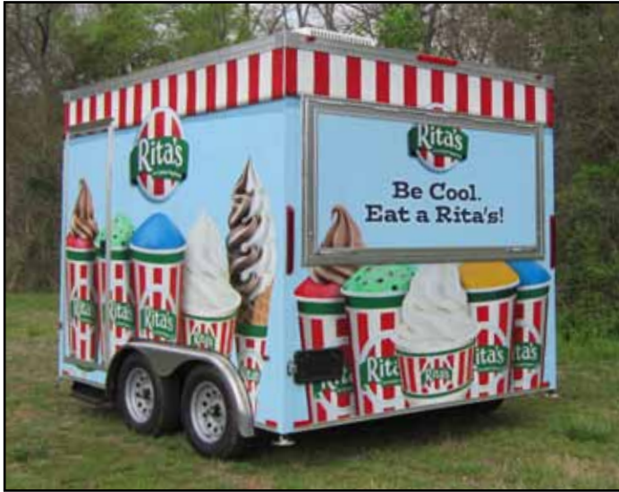
Model TL-81022W 10' Trailer for Dipping Box Only